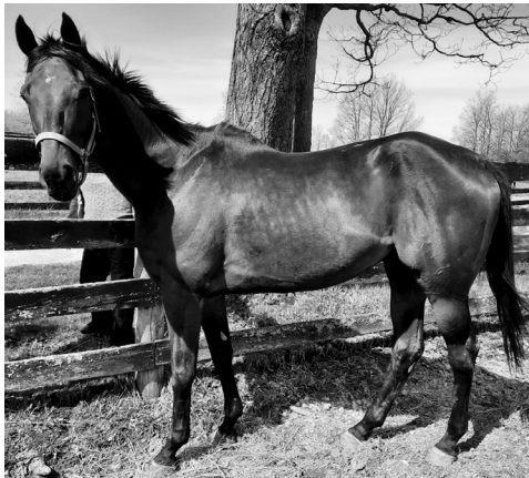
Neil's Diamond, now retired and returning home to his family thanks to the efforts of many people.